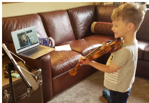
Virtual Violin Lessons over Zoom

On March 12th, Music Center's doors closed, but the music never stopped. Our amazing faculty and students have been creative and flexible. Individual instruction transitioned smoothly using digital technology. Ensemble Directors were innovative and resourceful, understanding the limitations which virtual ensembles faced and transitioned their teaching to focus on education over performance. Our goal was to keep our community connected and out of this we have built a stronger bond, together.