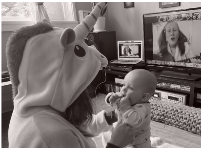
Virtual Music Together class | Spring 2020