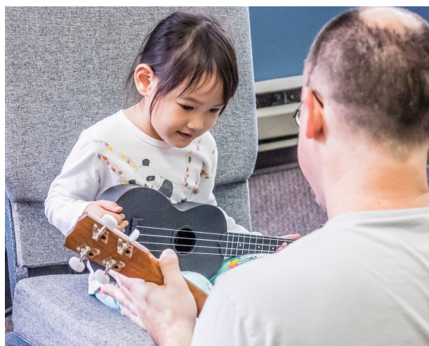
Music Center Open House | Sept 2019