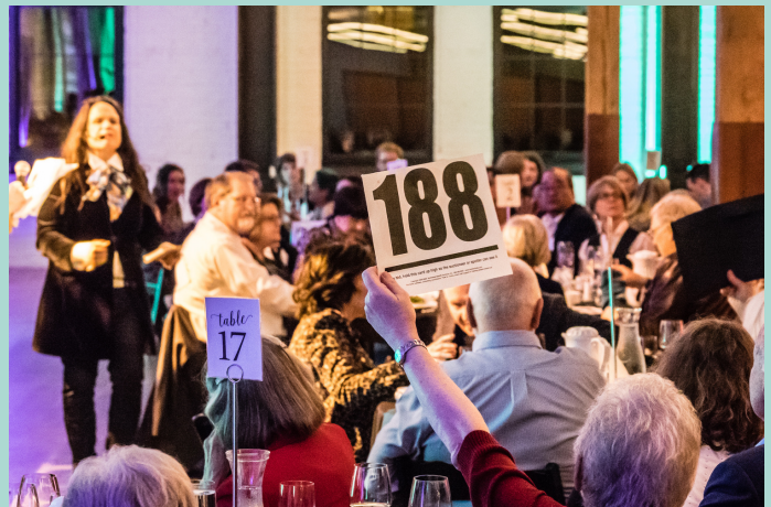
9th Annual Gala | November 2019