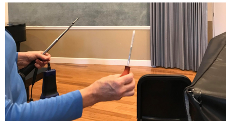
Airflow Evaluation in the Recital Hall | Summer 2020